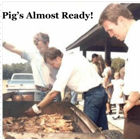
Pig's Almost Ready!